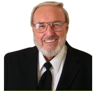
Yisrayl Hawkins THE HOUSE OF YAHWEH

The fact that they are not objecting to evil, shows they too are evil fools as the Savior said in: